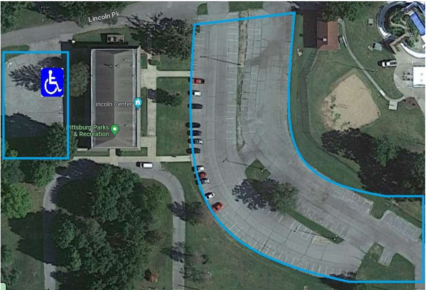
LINCOLN CENTER 710 W 9 TH ST PARKING AVAILABLE ON EAST SIDE. HANDICAP PARKING ON THE WEST SIDE.